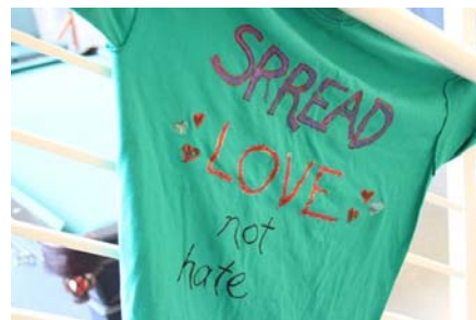
A shirt from our Clothesline Project hangs on display during the Shout Out!

Clients noted that our groups helped them feel less alone, improved their physical and emotional well-being, and improved their outlook on the future.