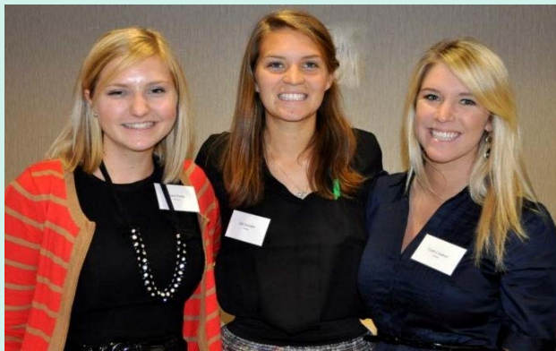
Volunteers welcome guests to our 24th Annual Holiday Auction.