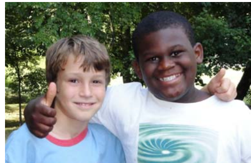
Students give a thumbs up to Safe Touches.

We also launched a 9th grade pilot program, offering two days on consent and communication. Through Start Strong, students learn skills for reducing the perpetration of sexual harassment and violence as well as actively and safely intervening in situations of violence.